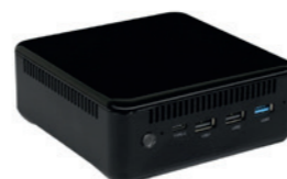
Art.-Nr. 212203 4GB RAM, 32GB Storage Art.-Nr. 213054 8GB RAM, 64GB Storage